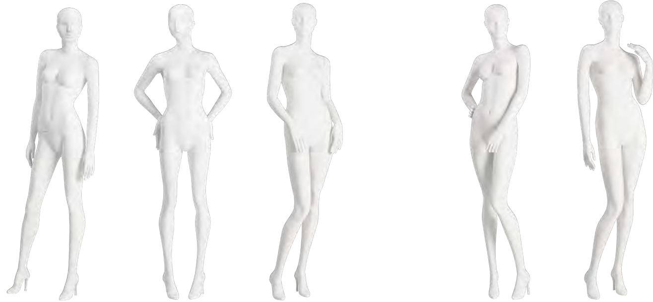
GTLF-07 GTLF-06 GTLF-02 GTLF-08 GTLF-04