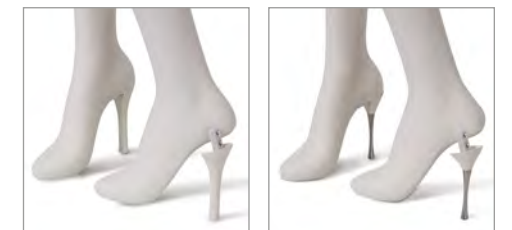
GTDH-B standard GTDH-A on request