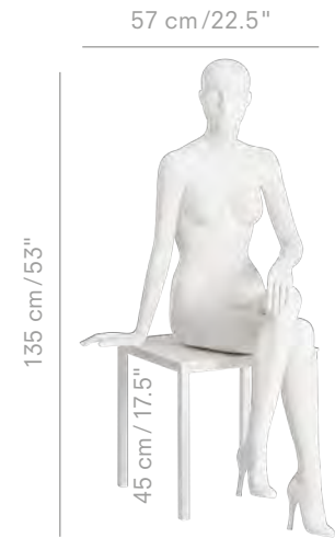
GTLF-11 incl. intake for safety steel cord