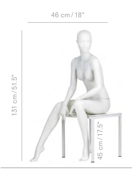
PURE-06 incl. intake for safety steel cord