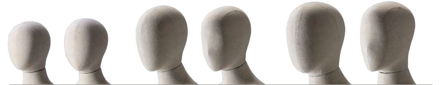
BKAH Dot-411020 kids 4-6 years