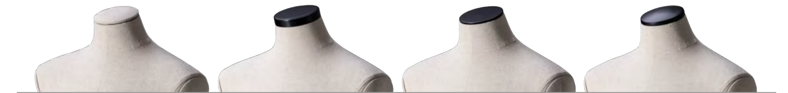
BFAN-01 / BMAN-01 wood, fabric covered (standard)