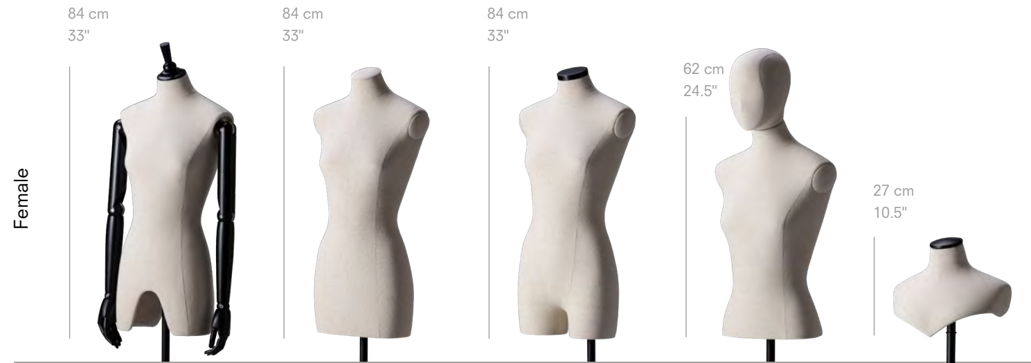
84 cm 33"