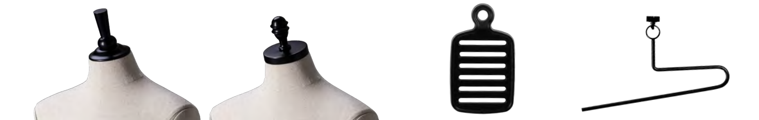
BFAN-05 / BMAN-05 wood, painted

The kids busts are only available with neck cap -01, -03 and -04. Please see page 294.