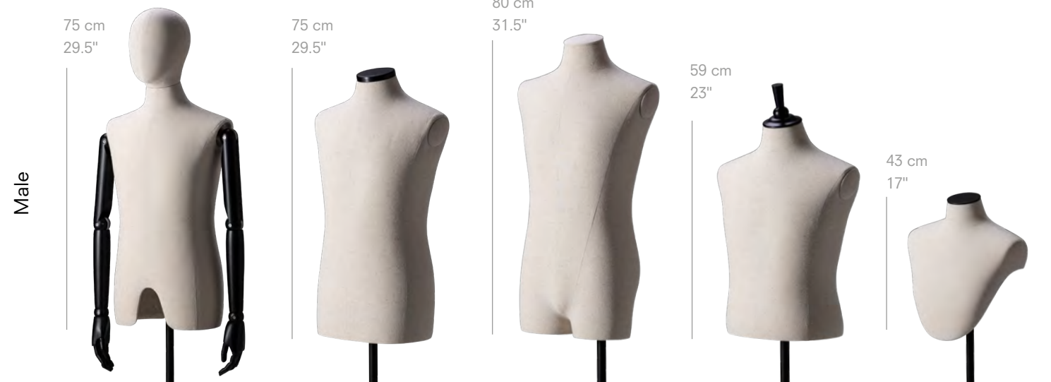
75 cm 29.5"