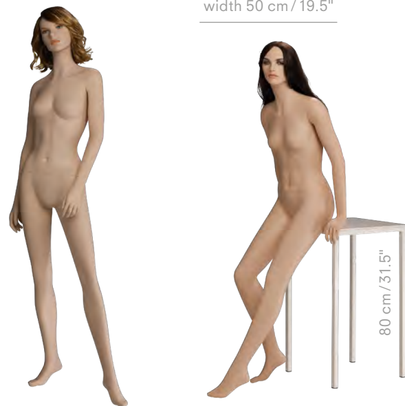
VNTF-05 VNTF-06 incl. intake for safety steel cord