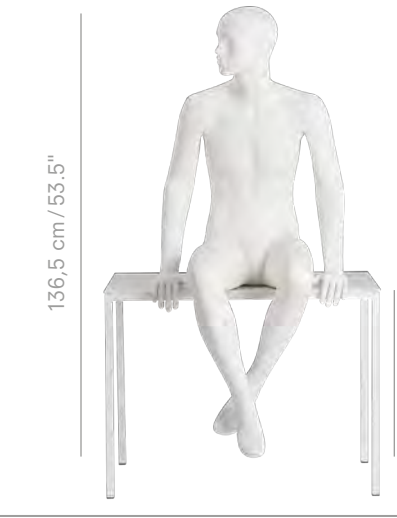
IDLM-10 incl. intake for safety steel cord