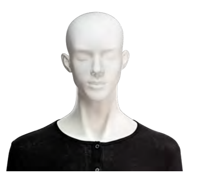
Head Yves-130001 only suitable for JULES mannequins